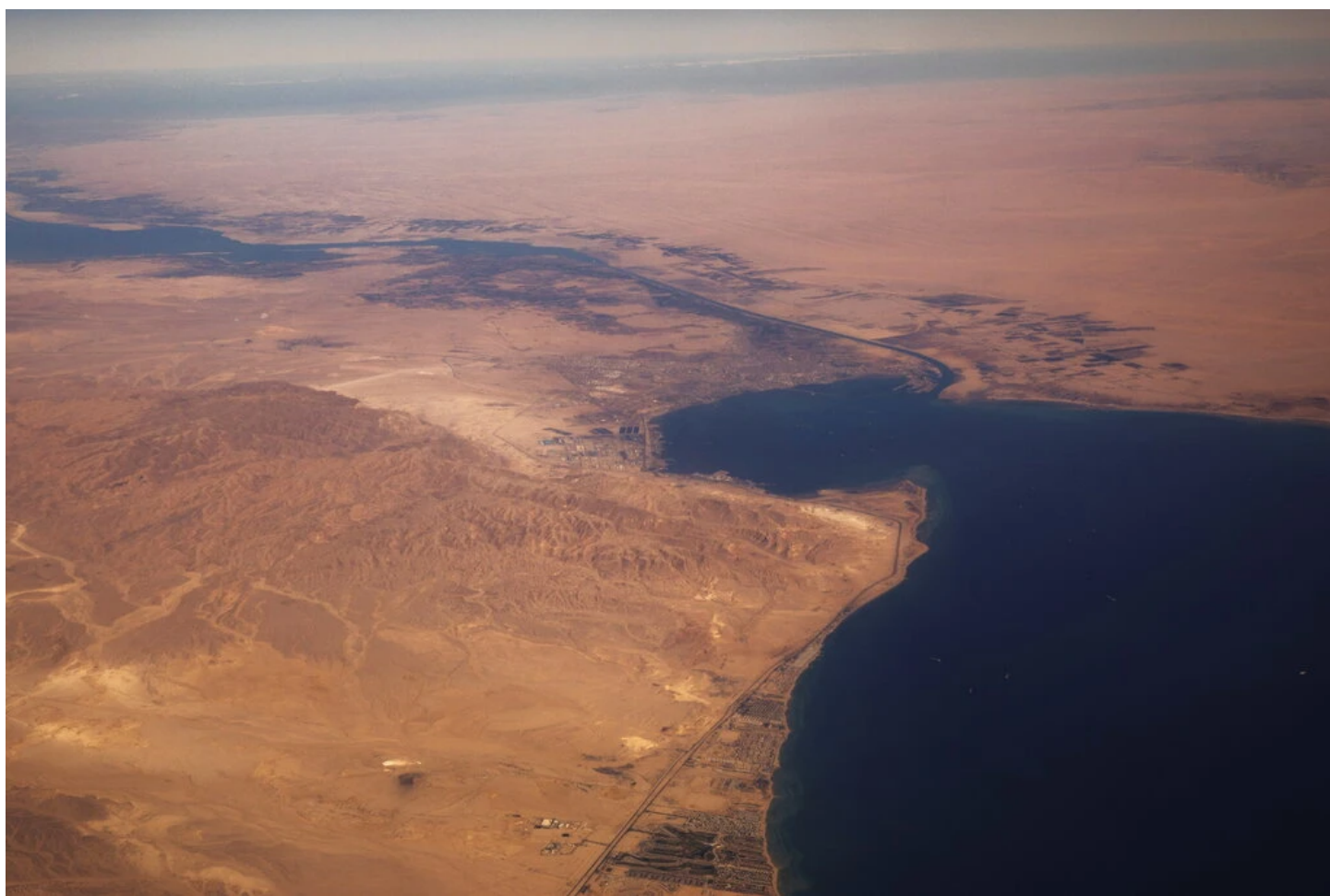
The 120-mile Suez Canal is a crucial route for global shipping, allowing ships from Asia to reach Europe without circumnavigating Africa.

Egypt announced plans in May to further widen and deepen the section of canal where the Ever Given got stuck, and more recently that it would purchase a fleet of more powerful tugboats, a support vessel and cranes that could lighten the load of any future grounded ship.