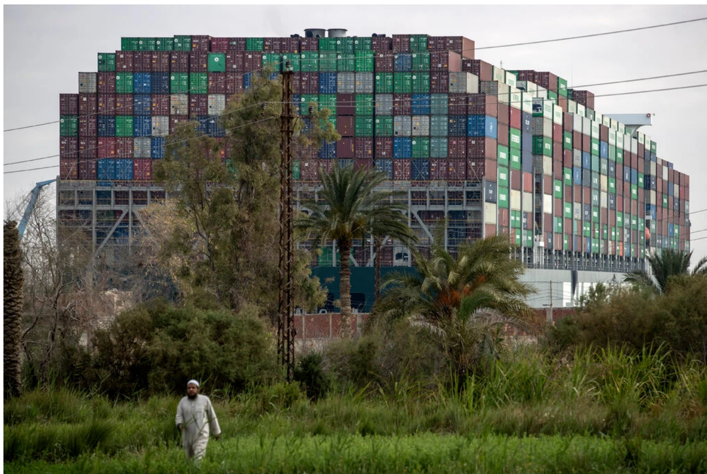
Cargo stacked 14 stories high on the Ever Given towered over palm trees on the banks of the Suez.