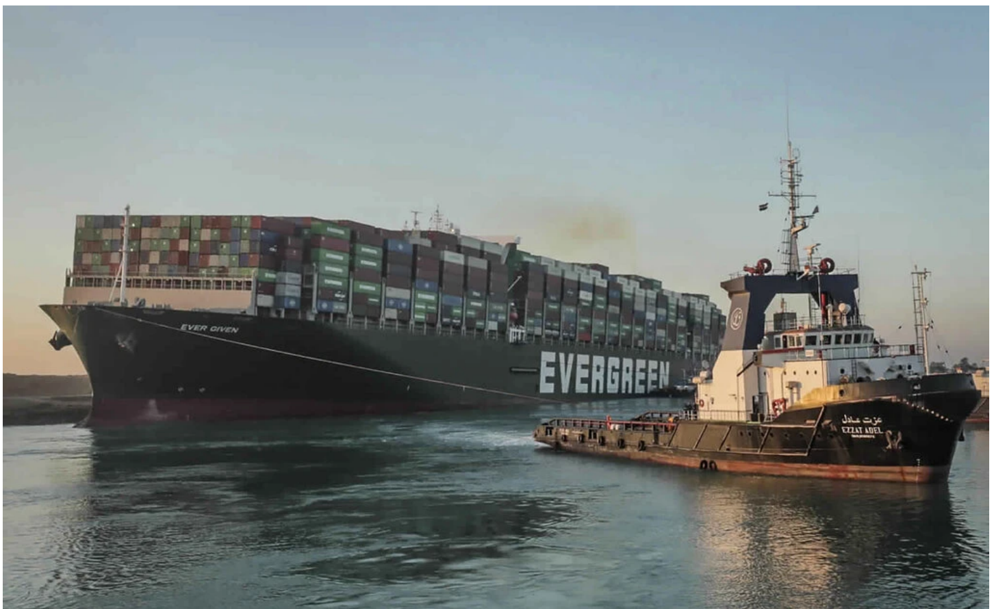
Almost free: A tugboat pulling the Ever Given's bow after the ship was partly refloated.

Tugboats began racing to the scene almost as soon as the ship ran aground, trying to pull it free. But the authority's rules require any ship of the Ever Given's size to be accompanied by two tugboats throughout its journey. Had the tugs been next to the ship, they could have intervened to nose it away from the canal's banks.