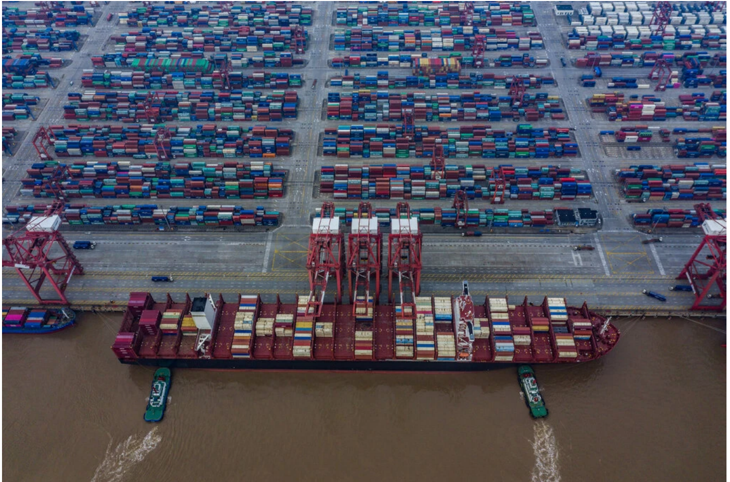
A giant container ship docking at the port of Shanghai. As container ships have grown larger, many ports and canals have not made adjustments to accommodate them.

Canals around the world have been widened to accommodate bigger ships, including the Suez, which has been dredged and in 2015 was expanded to add a second lane. But the 18-mile segment of the canal where the Ever Given got stuck was not widened. And the canal’s tugboats were not powerful enough to budge it once it did.