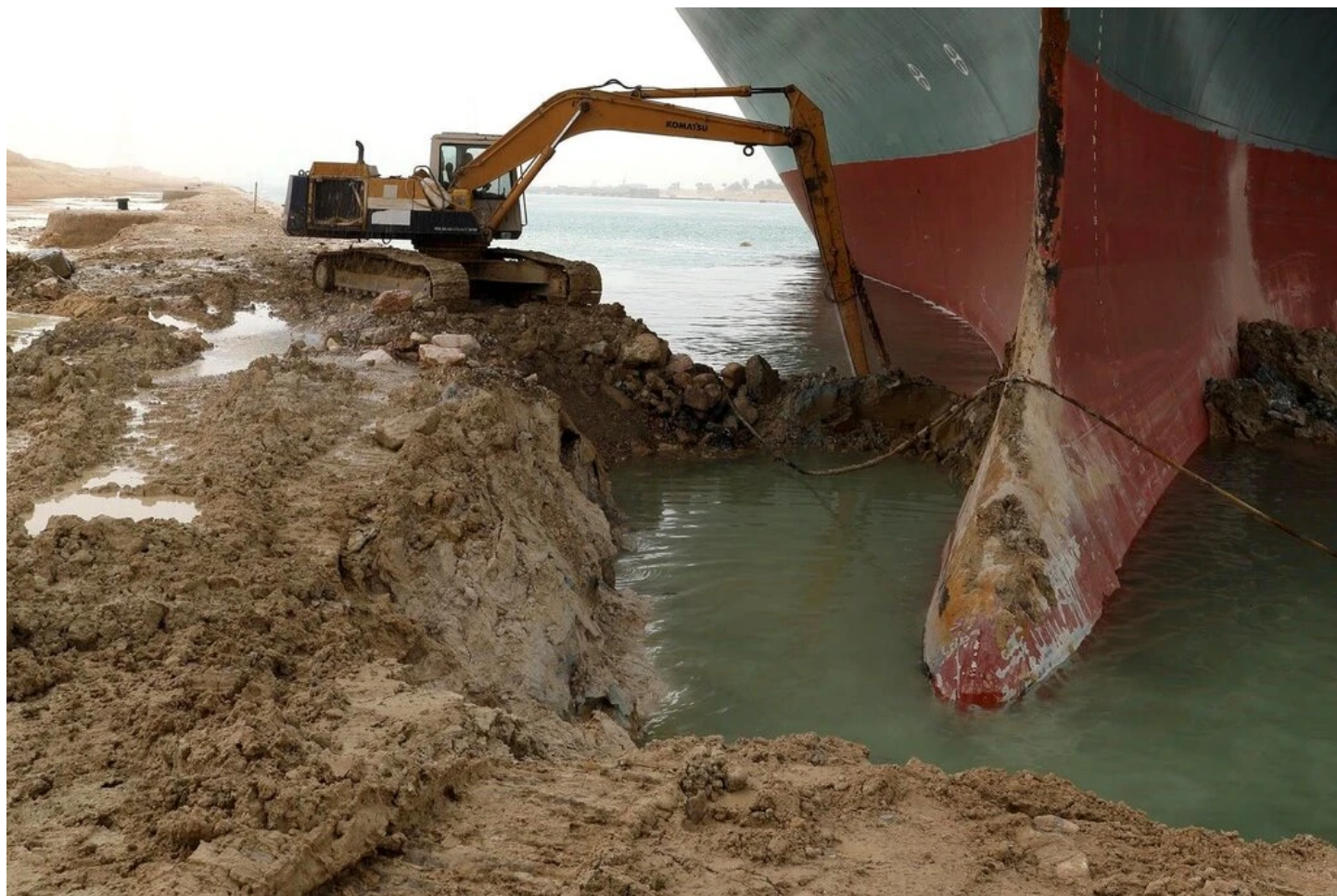
The image of a Lilliputian excavator digging out the Brobdingnagian Ever Given swiftly inspired a mountain of memes.

Sometime between the ship's disappearance in the sandy horizon that morning and its reappearance as the world's most ubiquitous internet meme, the back and forth between the pilots and the captain had descended into acrimony.